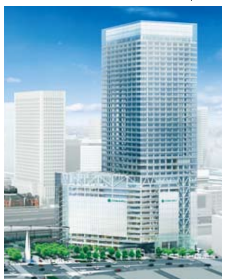
Rendering of Daimaru Tokyo store after increasing its floor space (summer 2012)

Daimaru Tokyo store completed the first phase of relocation and expansion and opened as a new store under the store concept of "TOKYO/ADULT/LIFESTYLE Department Store" in November 2007. In the first phase,