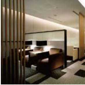
ANA Lounge, Shin-Chitose Airport