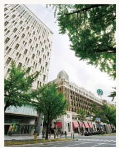
Daimaru Shinsaibashi store

For fiscal 2010, the revenue of department store business including affiliated department stores is projected to decrease by 1.1%, while operating income is expected to remain almost unchanged at ¥13 billion.