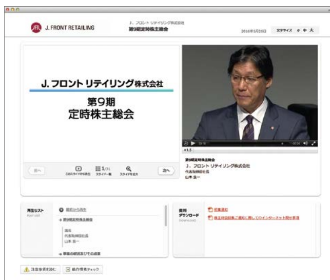
Recorded shareholders meeting presentation posted on our website

Starting with the 9th annual shareholders meetings, we deliver video of "business report" presentation given at the meeting on demand.