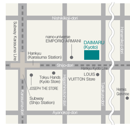
Shops operated by Daimaru Kyoto store