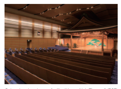
Cultural and exchange facility "Kanze Noh Theater" (B3F)

as a venue for various events. In the event of a disaster, it can be used to temporarily accommodate stranded people.