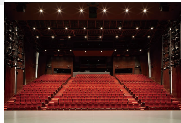
PARCO Theater

PARCO Theater newly opened in January 2020. Some performances were cancelled due to the COVID-19 pandemic. But various plays were performed by prestigious creators and actors in its opening series. “Guernica,” which was performed in September, received the Excellent Work Award of the Yomiuri Theater Awards and caused a buzz. We will continue to produce our own performances to provide theatrical experiences.