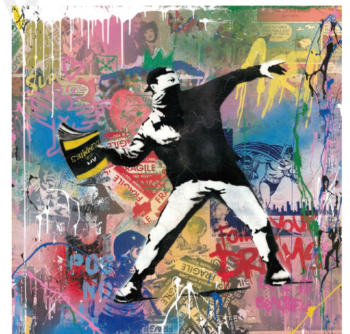
Banksy Thrower, 2019 Silkscreen and Mixed Media on Paper

At the same time, the exhibition was presented three-dimensionally online. A viewer at home can move in the exhibition venue and see a 360-degree view as if he/she were actually there.