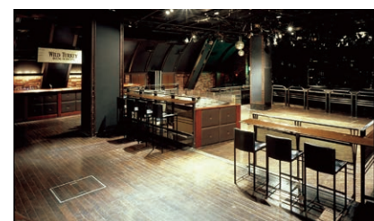
Shibuya CLUB QUATTRO

In addition, in Shibuya, we operate a music cafe and dining bar QUATTRO LABO that offers music and food and drinks in a space with a collection of various analog records and CDs.