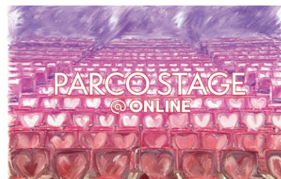
PARCO STAGE @ONLINE

This project is intended to communicate the appeal of the theater online. Responding to people's desire to “see,” “participate in,” “know more about,” and “see a bit behind the scenes of” the theater, we stream a variety of content. We provide enjoyable experiences to aficionados of plays and musicals and also provide people who have never stepped foot in a theater with opportunities to develop a new love.