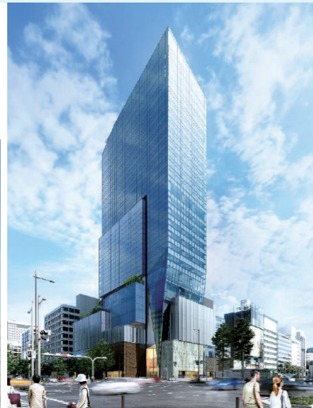
Rendering of "Shinsaibashi project (tentative name)"