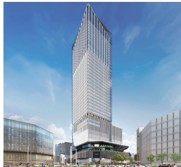
Rendering of "Nishiki 3-chome District 25 project (tentative name)"