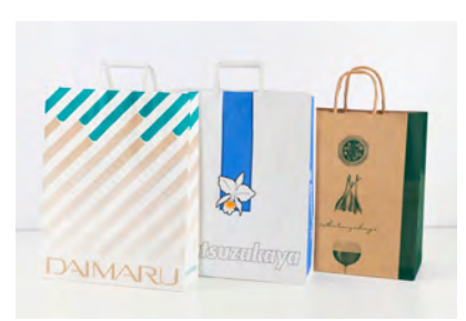
Shopping bags made from forest-certified paper

* 282,450 Stone-Sheets (full size paper equivalent) were used in fiscal year 2018.