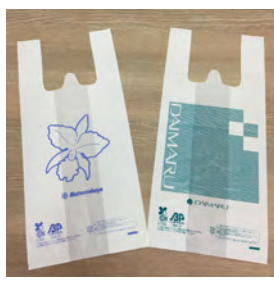
Plastic bags made from 30% biomass