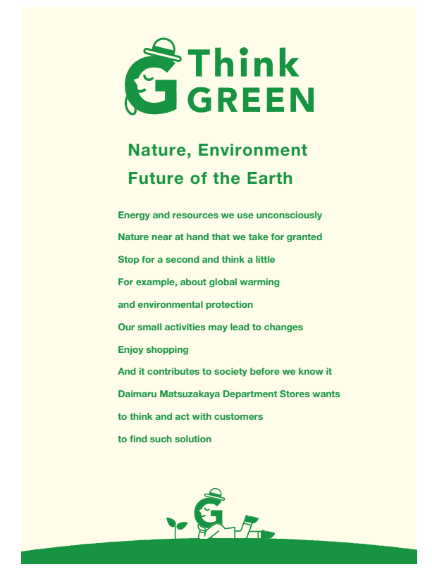
Concept of Think GREEN

Amid such circumstances, we released an animation titled "GREEN-san's slow eco diary," which provides easy eco lifestyle tips to continuously communicate with customers during the period when our stores closed temporarily and the voluntary ban on leaving home was requested. We will continue to provide information on the website "Think GREEN at home" so that customers enjoy at home.