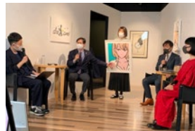
Webinar talk event on modern art