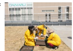
Honey project in Daimaru Shinsaibashi store