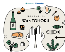
Think LOCAL with TOHOKU